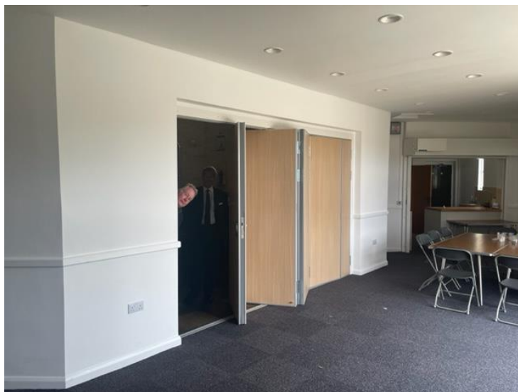
Fr Jeffrey in the new small hall at St Luke's

At a cost of £120,000 the grounds have been fenced off, creating a safe space for outdoor activities, fire exits have been improved, the server's sacristy enlarged, kitchen and toilets replaced, and external storage supplied. In particular, three small rooms have been knocked together to create a useful small hall, which can be opened onto the church. In October, the building work was blessed, the children's choir sang 'Panis Angelicus' by Cesar Frank, and everyone enjoyed a buffet lunch with celebration cakes afterwards.