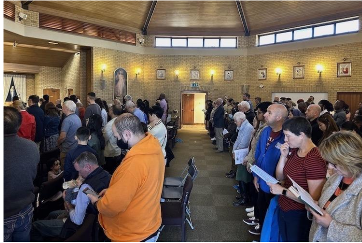
St Luke's growing congregation

Among recent projects, at St Luke's, Peterborough , considerable housing development in the area has led to significant growth in recent years. There are now three Sunday morning Masses instead of one and attendance has more than doubled over the past five years alone. The church community is young and diverse, bringing much new life and freshness to the parish, along with a new voluntary aided primary school, St John Henry Newman.